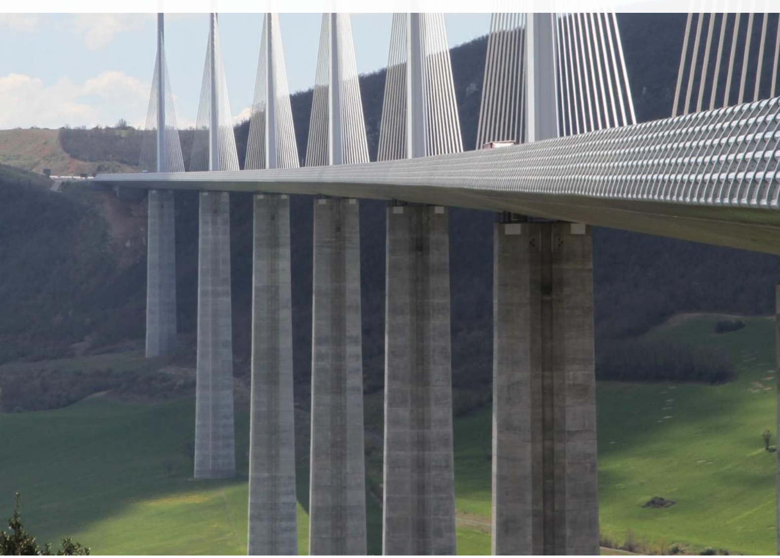
International Securities Services Association

It is ISSA's intention that this report should be updated periodically. This document does not represent professional or legal advice and will be subject to changes in regulation, interpretation, or practice. None of the products, services, practices or standards referenced or set out in this report are intended to be prescriptive for Market Participants. Therefore, they should not be viewed as express or implied required market practice. Instead they are meant to be informative reference points which may help Market Participants manage the challenges in today's securities services environment. Neither ISSA nor the members of ISSA's Working Group warrant the accuracy or completeness of the information or analysis contained in this report.